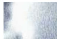
d: Silver PET

other materials not available for this size