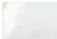
c: Shiny couche paper (mostly used)